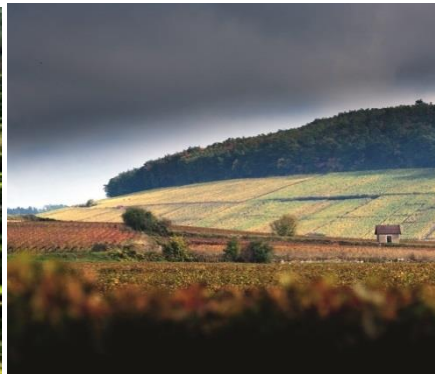
Climats of Burgundy vineyards (France)